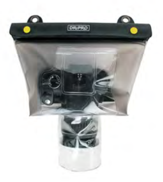
Model No. 872006