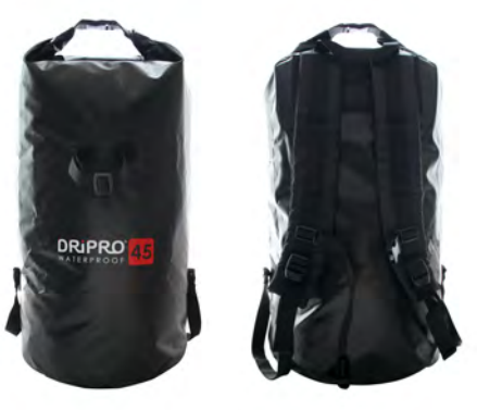
Model No. 611045