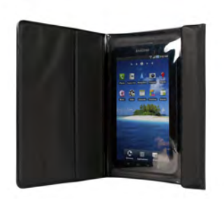
Model No. 875003