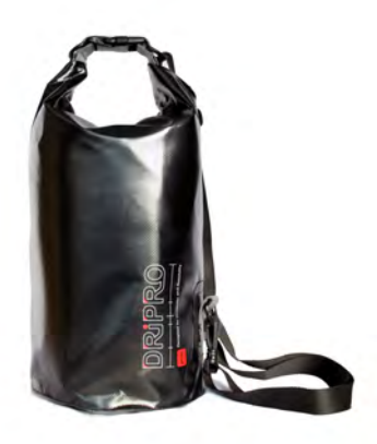
Model No. 611008