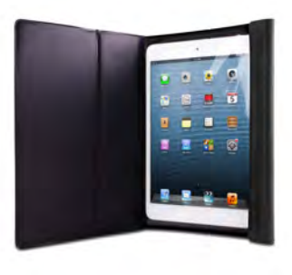
Model No. 875004