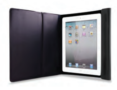
Model No. 875002